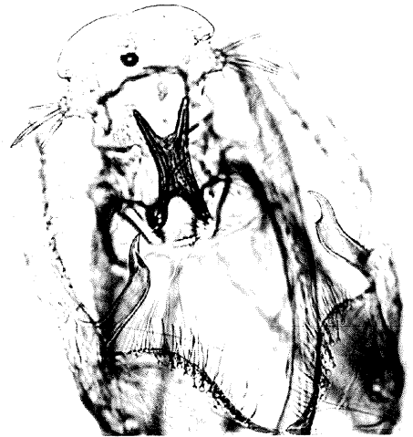
Fig. 2. Closer view of the abnormal gnathos of Bryotropha galbanella (see also Fig. 1).